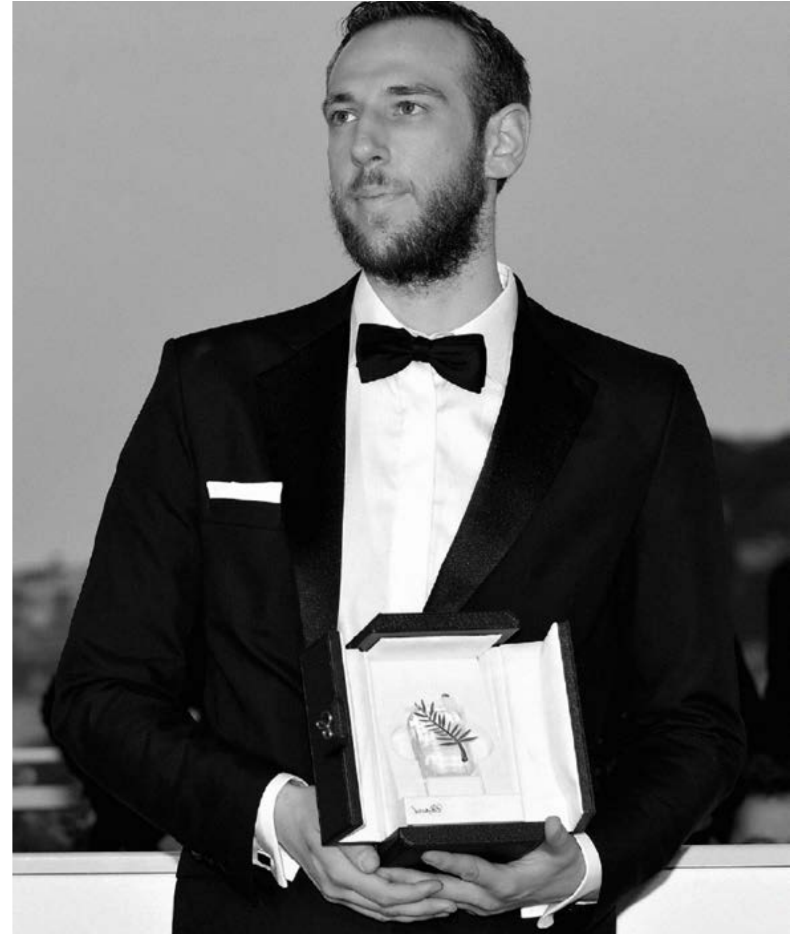
Vasilis Kekatos, winner of the Short Film Palme d'or for "The Distance Between Heaven and Us"